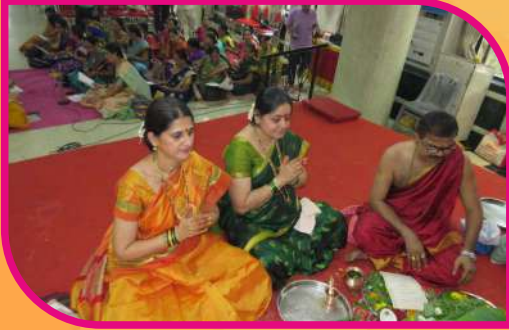
Vara Mahalaxmi Pooja - 2018