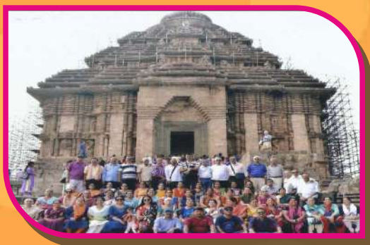
Pilgrimage/tour to Odisha, Kolkata & other places