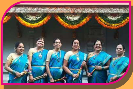
Variety entertainment Participants