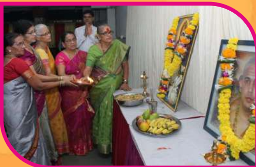
Sharada Pooja Aarati - 2018