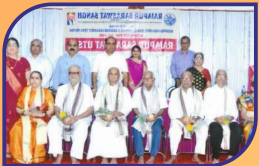
Senior Members of samaj are being felicitated on completion of their 75 years