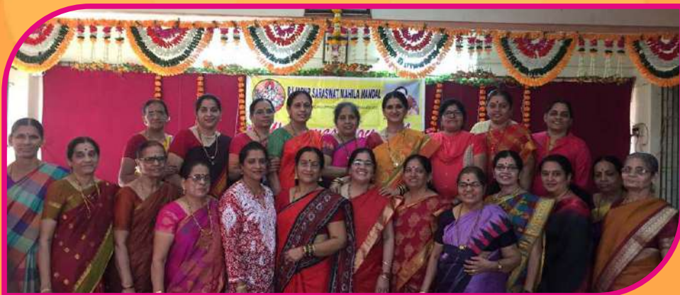
Mahila Mandal committee members