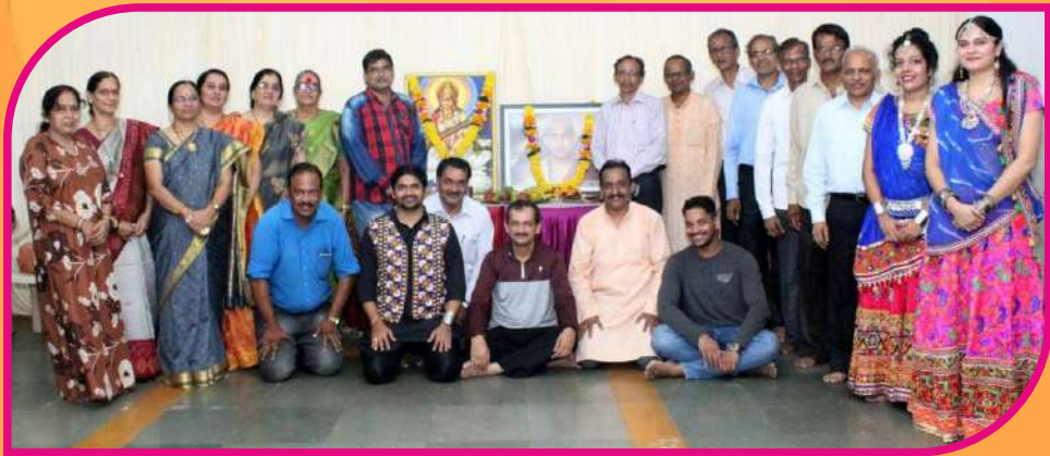
Sharada Pooja/ Navratri Utsav - 2018