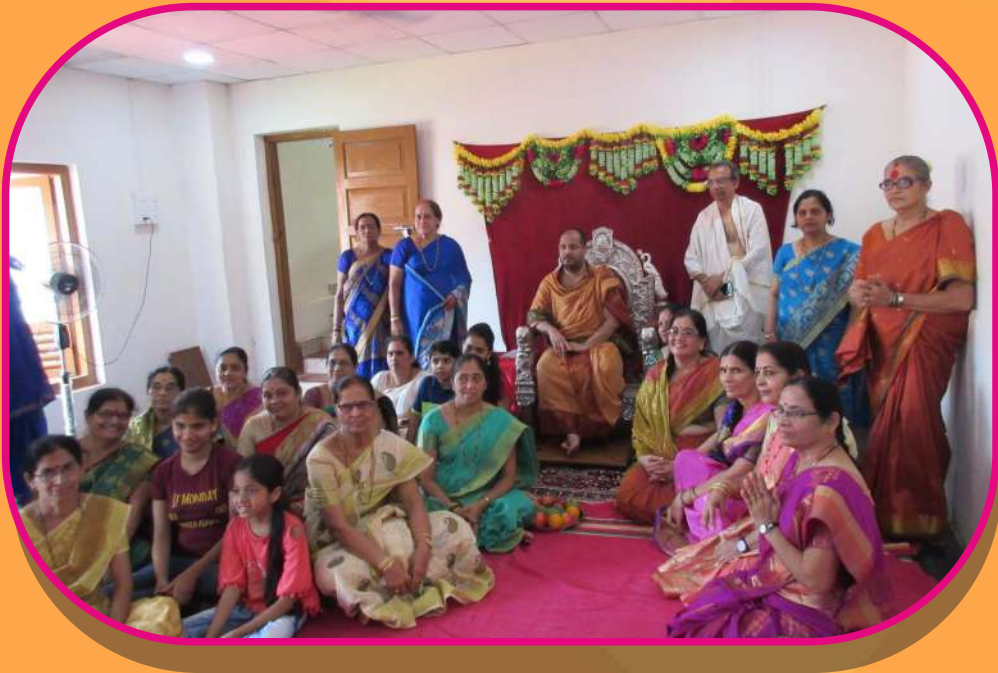
With H.H. Shivanand Saraswati Swamiji during Chaturmasya Vrita-2018