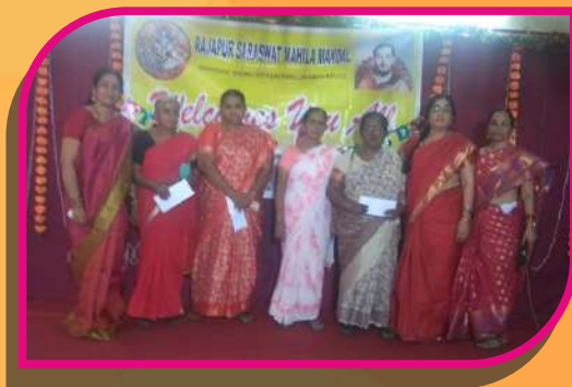
Distribution of Financial assistance