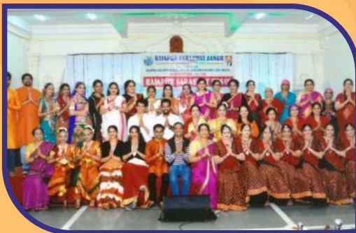
Artists on stage