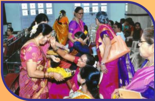
Distribution of til-gul by Mahila Mandal members